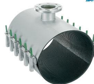
Flanged and Muff Outlet Clamps. ATT, ATC and ATS models.