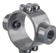
Ø114,3 mm PP Saddle 3/4" vs 1" Female 25,5 mm and 22,5 mm Insert Options