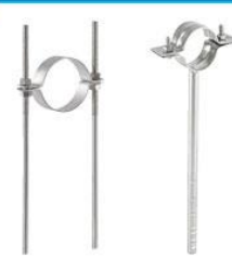
Other Clamp Options